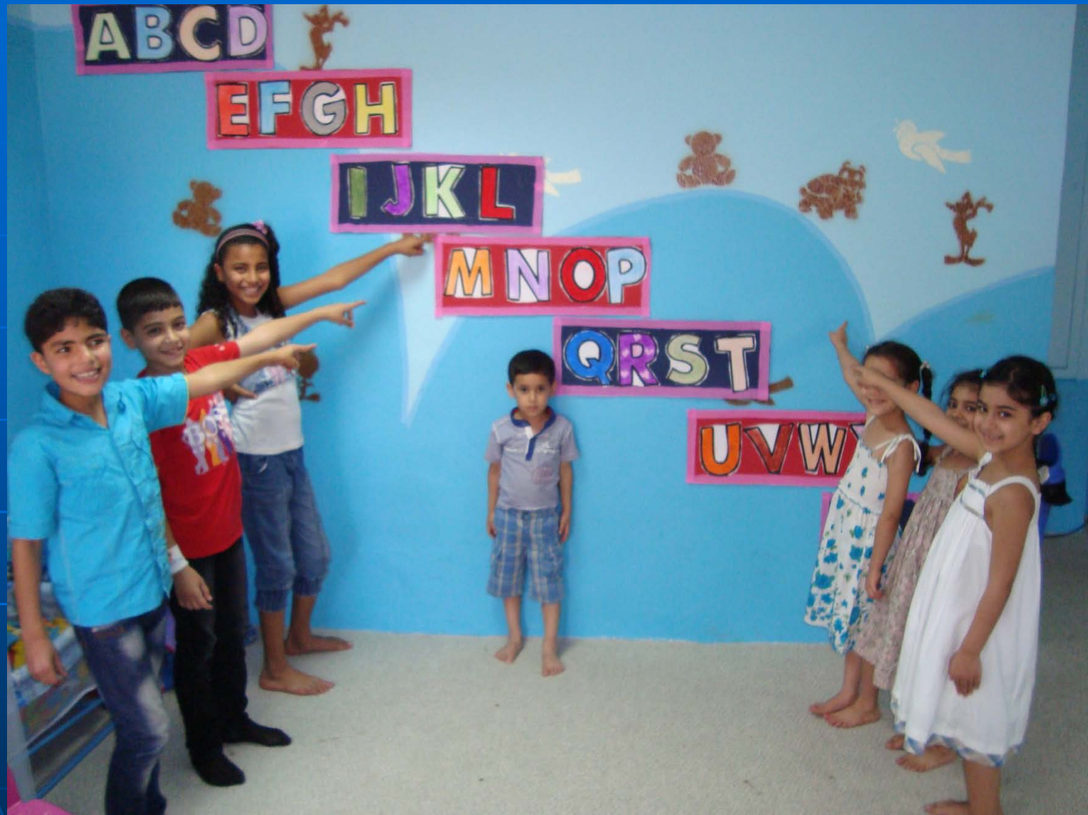
“Learning my ABCs”