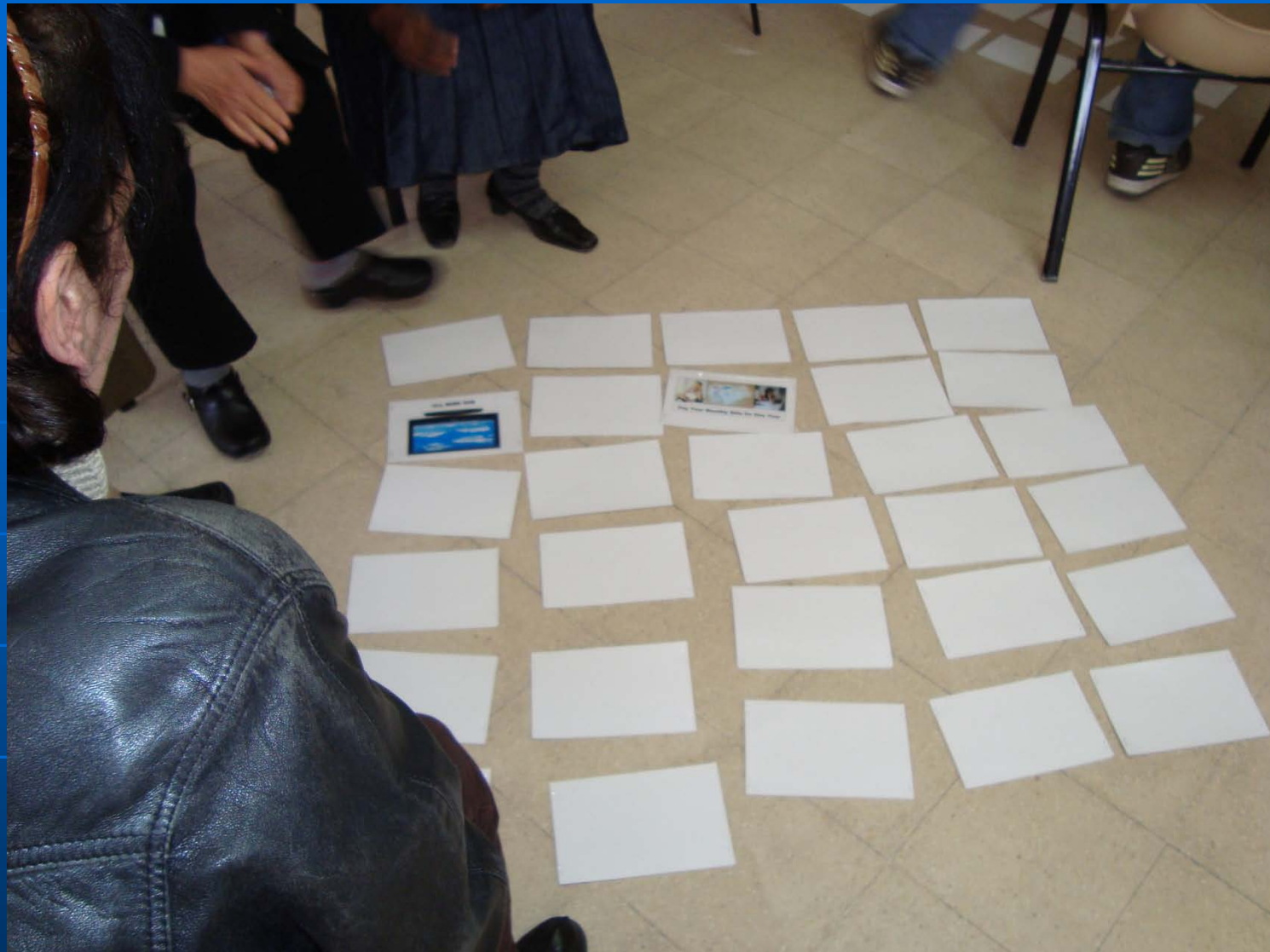
Matching cards game on role of the RA