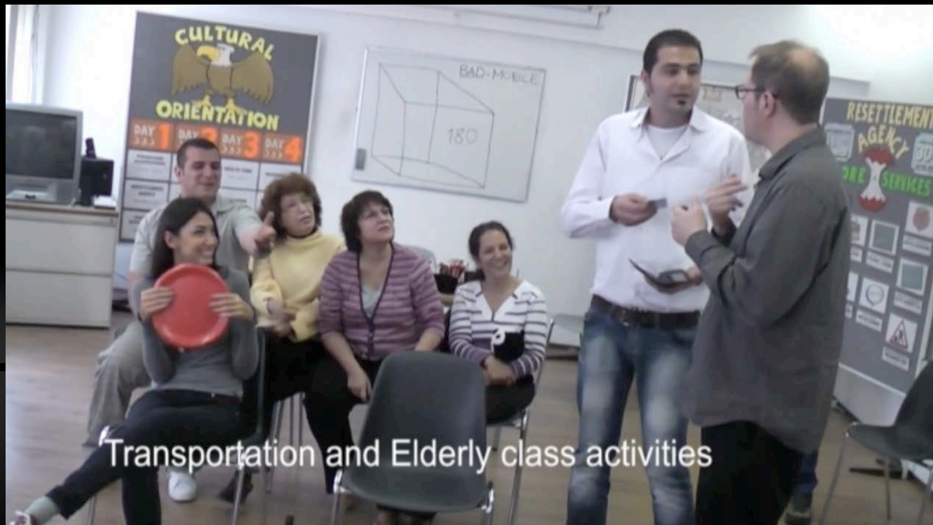
Transportation and Elderly class activities