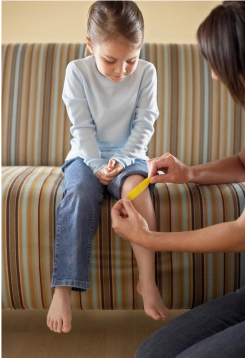
A. Care for it yourself.