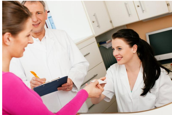
B. Make an appointment with your doctor's office.